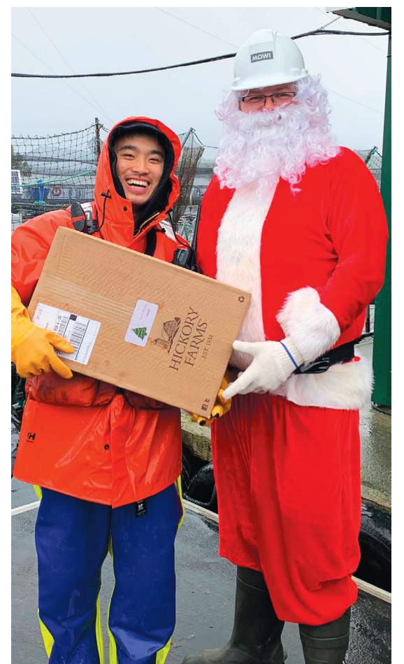
Santa made an early stop-off in the Broughton to deliver gift boxes to the farms. They must have all been on the "Nice" List