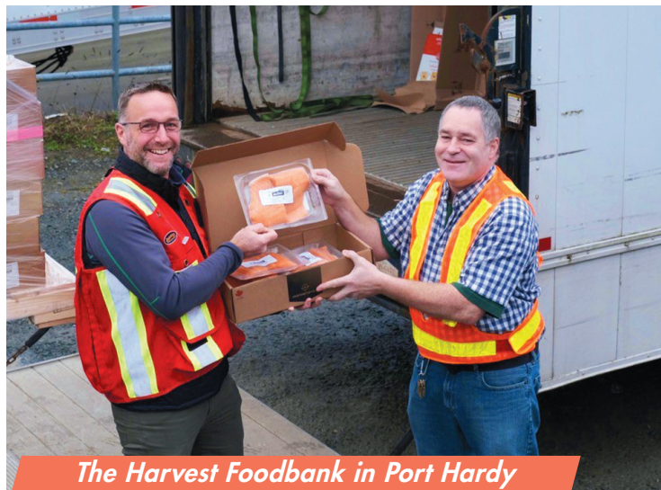
The Harvest Foodbank in Port Hardy

We were able to provide 600 1lb portions of our salmon so that every household they supply was able to have a delicious salmon meal this festive period.