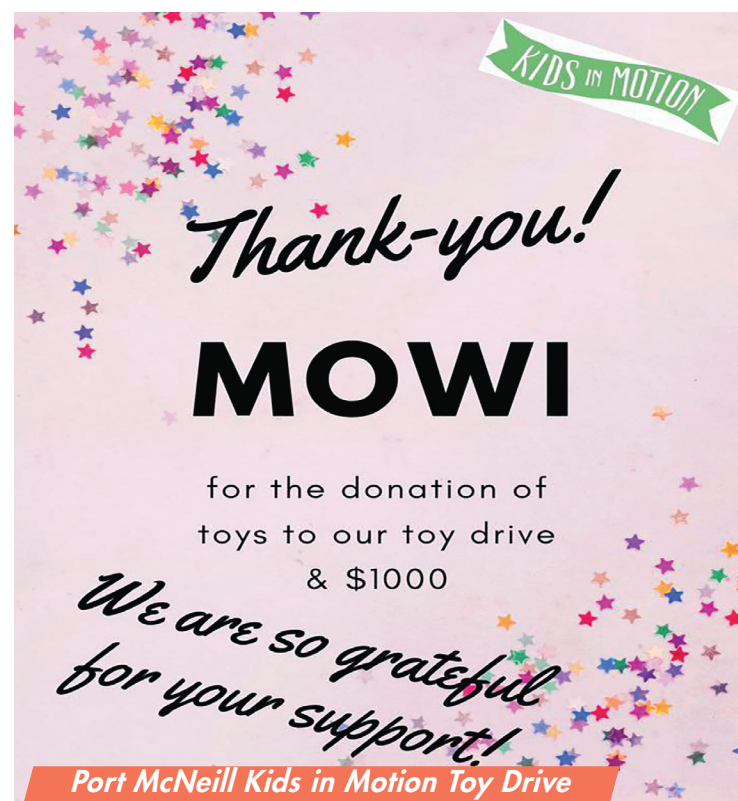
Port McNeill Kids in Motion Toy Drive

It was great to be able to contribute to the Kelsey Centre's Annual Christmas Family Party and help to make sure it was an enjoyable event for everyone.