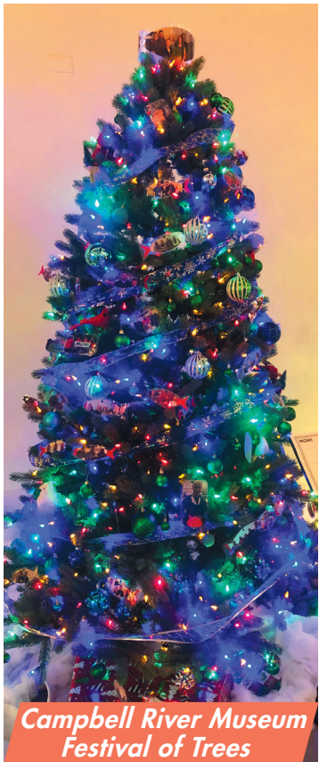
Campbell River Museum Festival of Trees

These photos show some of the recipients for 2019.