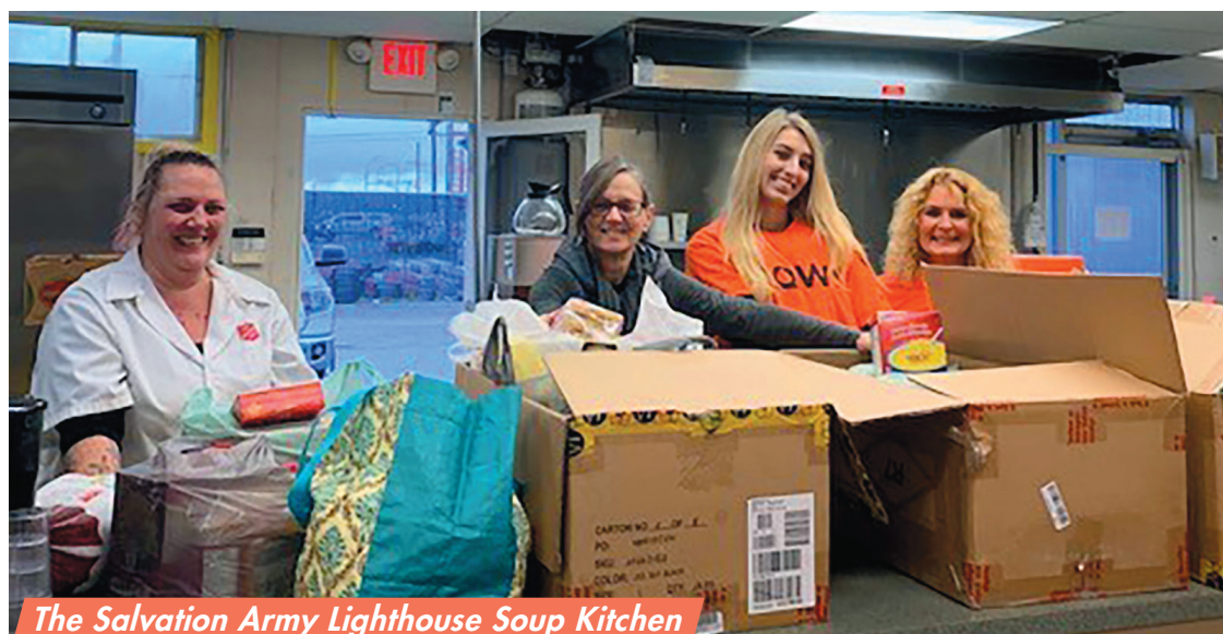
The Salvation Army Lighthouse Soup Kitchen

We donated items collected at our Christmas party to the Rose Harbour Women's Centre in Campbell River.