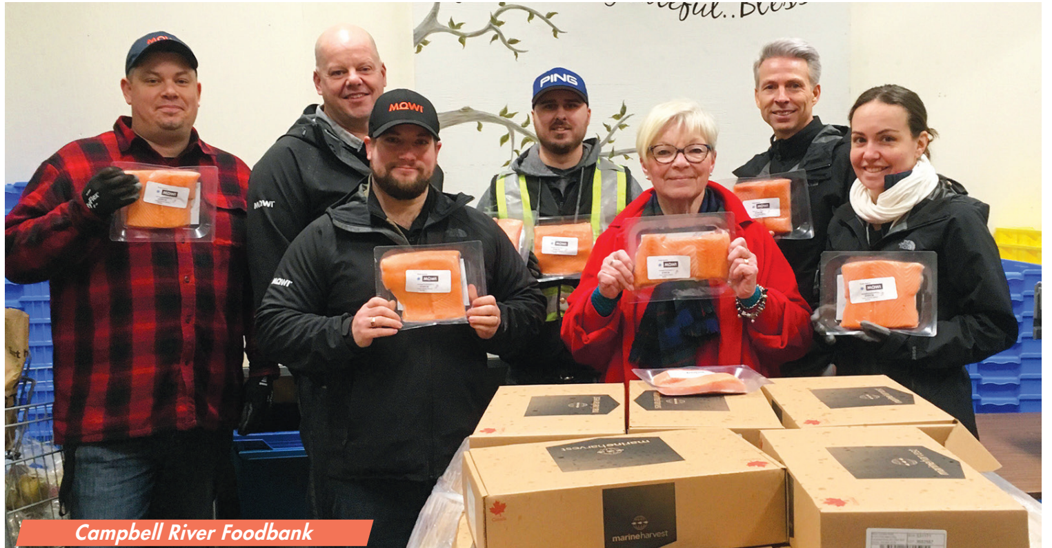
Campbell River Foodbank

Mowi were one of 28 companies to decorate a tree and our "Many Faces of Mowi" tree looked great! We featured pictures of as many of our nearly 600 employees as we could.