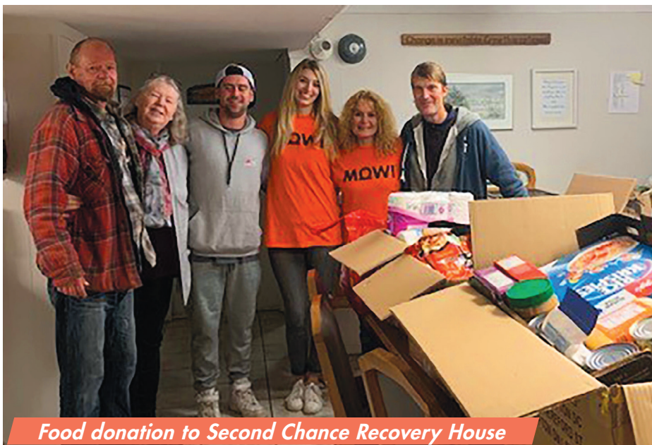
Food donation to Second Chance Recovery House

Mowi's staff donated 45 shoeboxes for The Campbell River Shoebox Project.