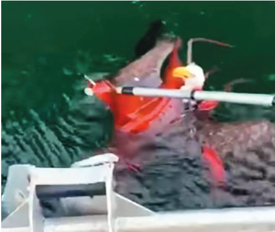
Bald eagle in the clutches of an octopus before being rescued by Mowi Canada West workers

When staff at the Mahatta West farm in Quatsino saw a bald eagle had bitten off a lot more than it could chew in December, they rescued the hungry bird from the enormous octopus it was wrestling with and captured the battle on video.