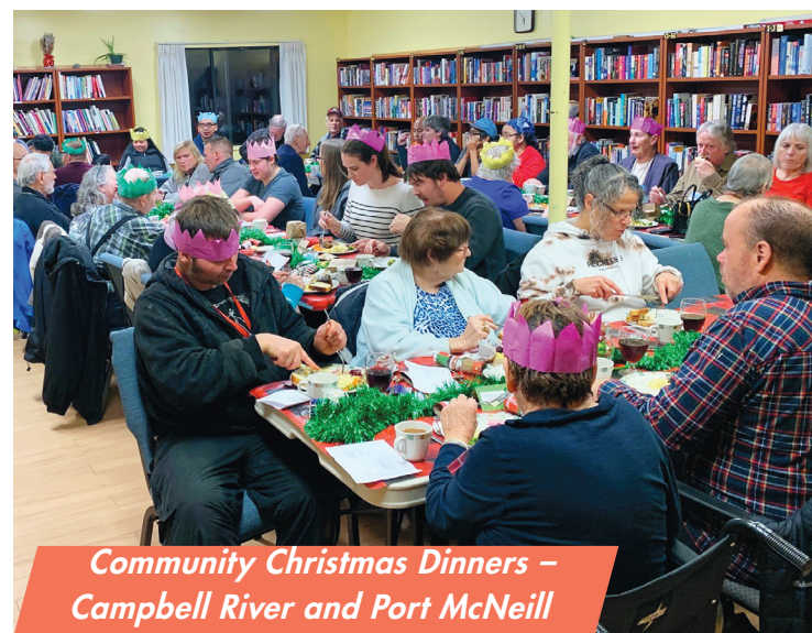
Community Christmas Dinners – Campbell River and Port McNeill

We donated items collected at our Christmas party to the Salvation Army Lighthouse Soup Kitchen.