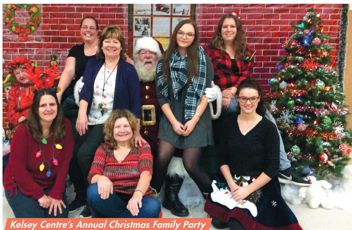
Kelsey Centre's Annual Christmas Family Party

It was great to be able to contribute to the Kelsey Centre's Annual Christmas Family Party and help to make sure it was an enjoyable event for everyone.