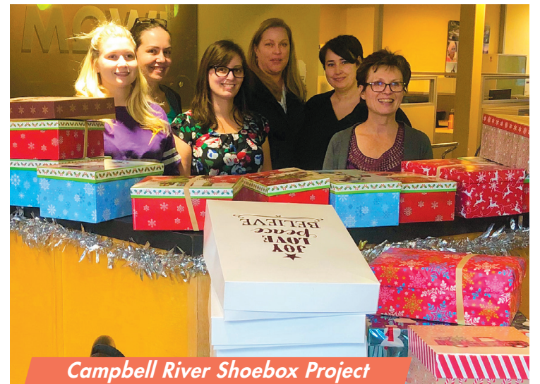
Campbell River Shoebox Project

We provided nearly 500 1lb portions of our salmon, enough for every household they support