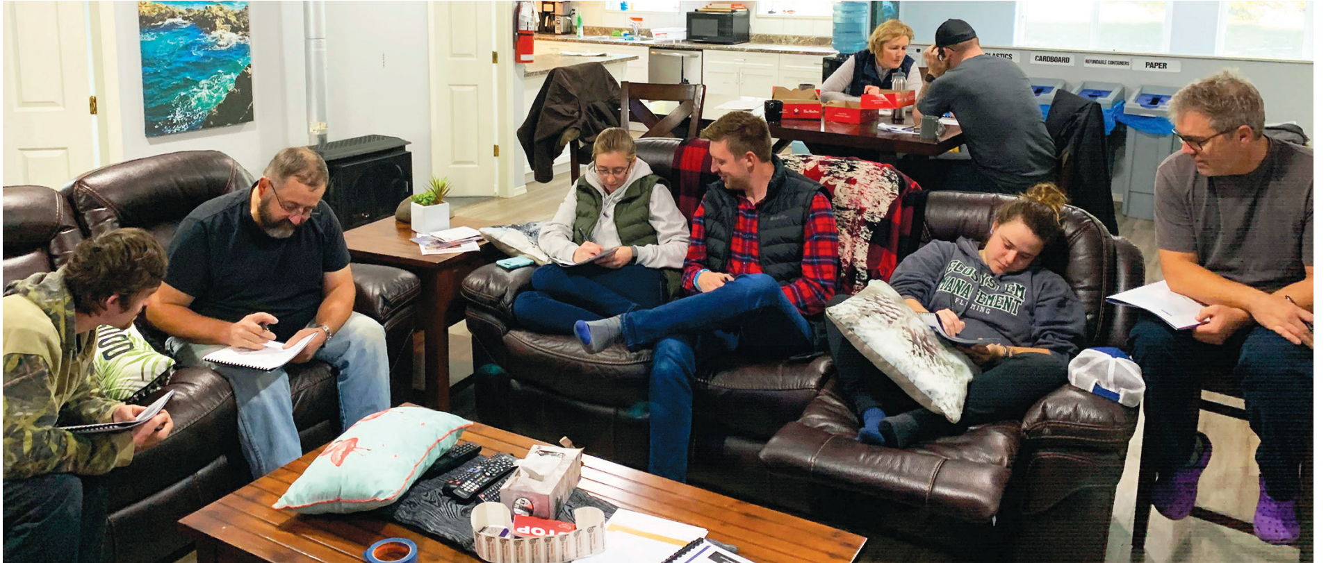
Mowi Canada West workers engage in BrainSafe training

In 2012, Mowi Canada West began a BrainSafe journey to improve safety for people, reduce incidents, and embed why safety is truly important.