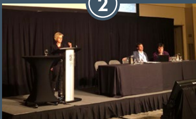
Learning and Sharing at the AAC Conference