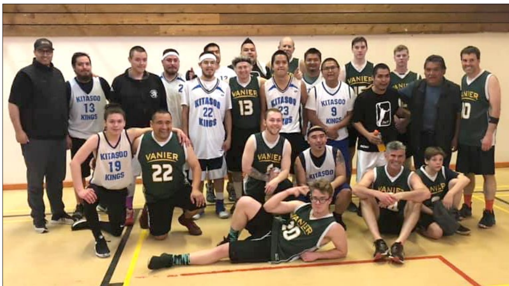
The Kitsoo and Vanier Teams exemplifying the spirit of the tournament