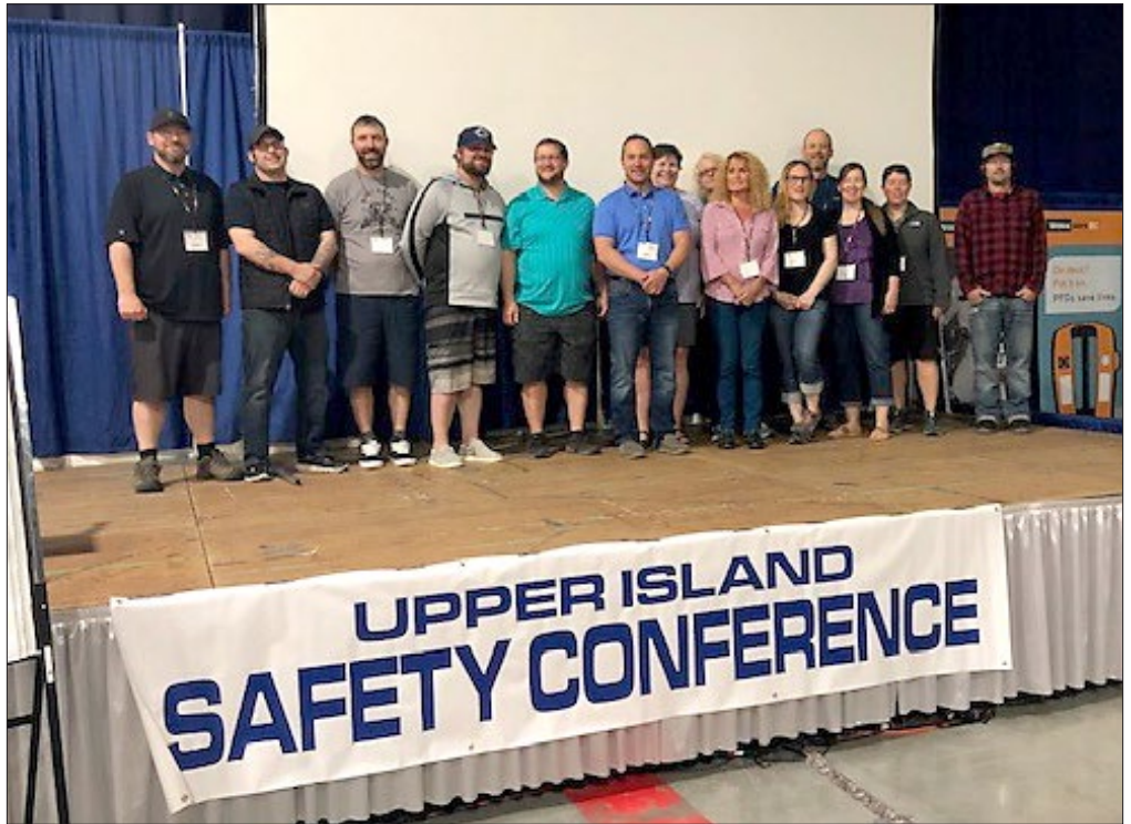
Mowi staff at the Upper Island Safety Conference

"This year we had great participation from our Joint Health and Safety Committee members in processing, production, and warehousing. This diversified group attended training for new and young workers, marine safety, safety culture, risk evaluation, mental health, lockout, and much more to share new skills with their worksites and teams."