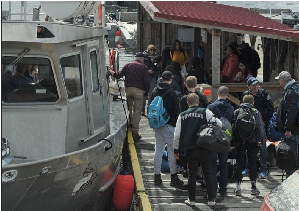
The journey to Klemtu was a part of the overall experience for the Comox Valley team