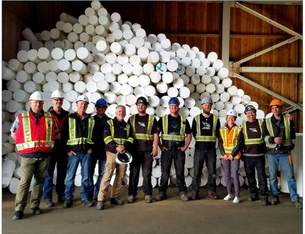
The teams from Mowi Operations and Van Island Plastic Factory (VIPF) with the polystyrene ready to be reused

100% of the polystyrene foam was repurposed into the new cage builds. Reusing this material was a great way to reduce our environmental impact as well as save us money.