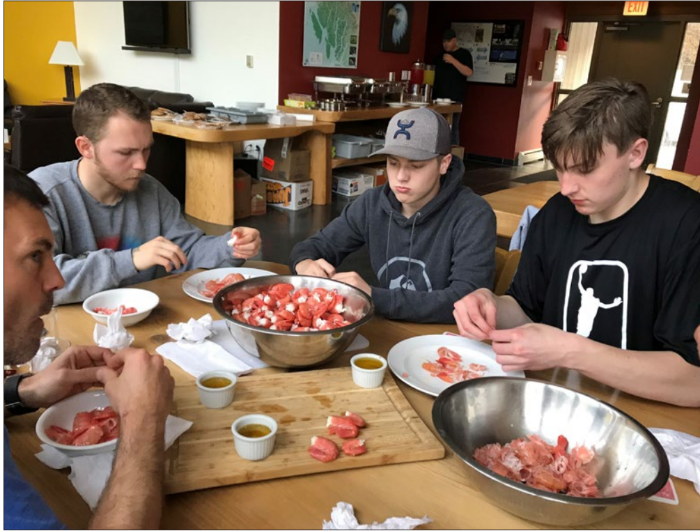
There were many new experiences for the visitors to get to grips with