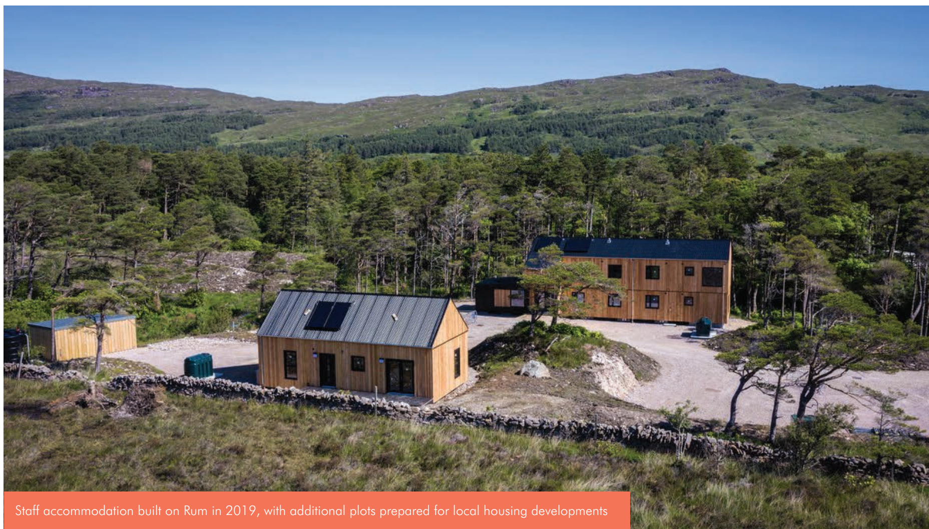
Staff accommodation built on Rum in 2019, with additional plots prepared for local housing developments

"This is really great news for the people of Colonsay. We know from our experience at Rum, the difference that affordable, quality housing can make to people in rural communities. We are committed to Colonsay and want to see the island community thrive so we were delighted to support this initiative and look forward to seeing local people getting keys to their own homes."