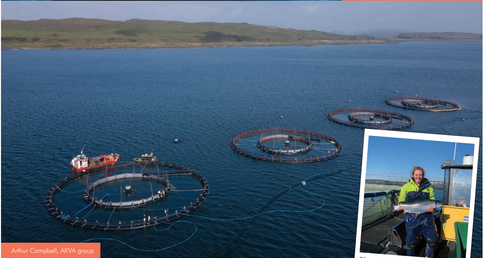
Arthur Campbell, AKVA group